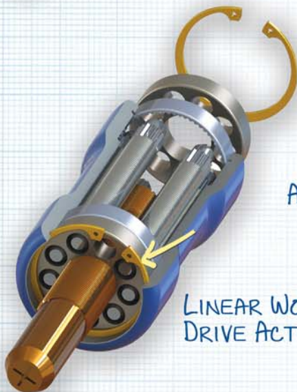
LINEAR WORM DRIVE ACTUATOR