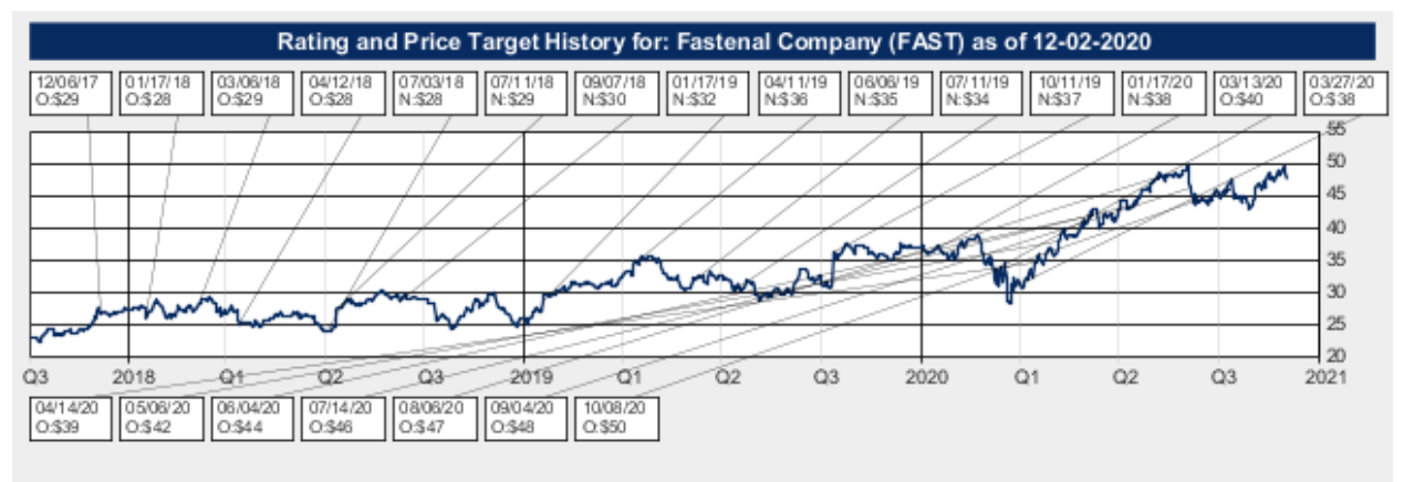
Created by Blue Matrix

Fastenal Company (FAST-$47.44-Outperform) W.W. Grainger Inc. (GWW-$404.16-Outperform) MSC Industrial Direct Co. Inc (MSM-$82.42-Outperform) (See recent research reports for more information)