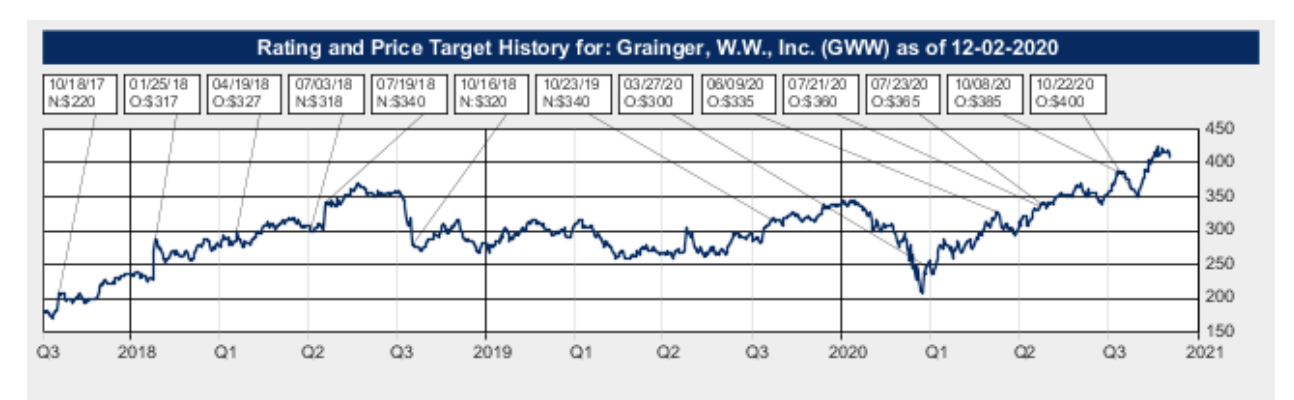
Created by Blue Matrix