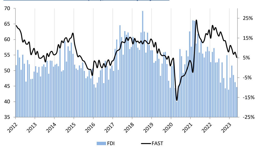
*FAST March 2020 – December 2021 Monthly Sales Presented as ex. Safety Products